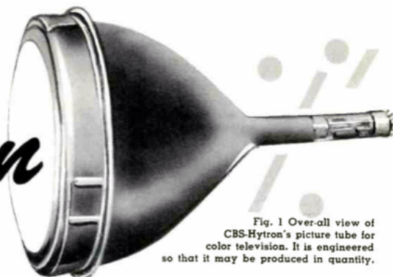
Fig. 1 Over-all view of CBS-Hytron's picture tube for color television. It is engineered so that it may be produced in quantity.